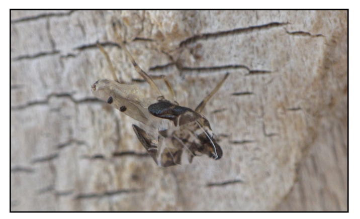
Fig. 3. The shed skin of an elm seed bug.

Smaller nymphs have a deep red abdomen and black head and thorax (Fig. 2d). As they grow, nymphs develop black wing pads and the abdomen takes on a mottled pink color with two black dots in the middle of the back (Fig. 2e).