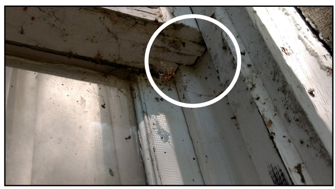
Fig 7. Elm seed bugs easily enter structures through gaps in the window frames.

Little research has been conducted on the chemical management of elm seed bug. In Italy, etofenprox (Group 3A, pyrethroid) was found to be the most effective active ingredient for managing elm seed bugs, but few chemicals have been evaluated.