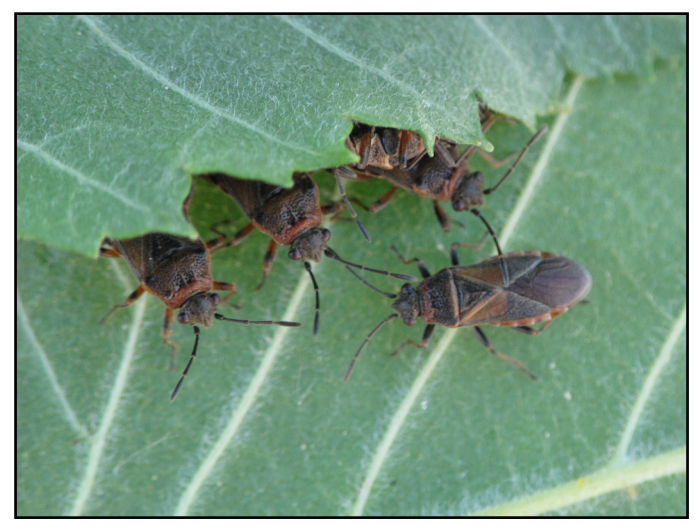
Fig. 1. Elm seed bug adults hiding under overlapping elm leaves.

As a member of the seed bug family (Lygaeidae), this insect feeds primarily on elm seeds, but has also been reported on linden and oak. In Utah and Idaho, it has also been observed feeding on elm leaves. In Utah, as in other locations, this insect has