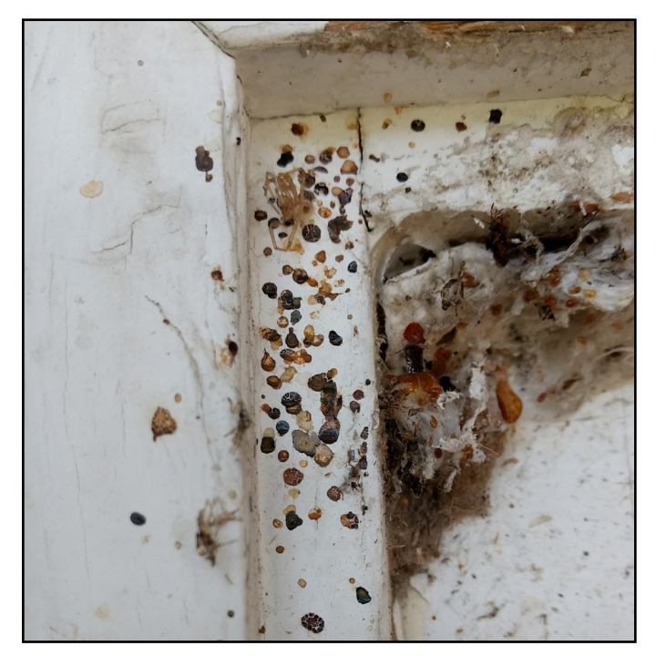
Fig. 4. Fecal spots of elm seed bugs on a window frame.

Seal windows and doors as tightly as possible with sealant, weather stripping, tight-fitting screens and doors sweeps. Pay particular attention to where two sliding windows meet (Fig. 7). If windows are unopened, consider using tape or removable caulk to exclude elm seed bugs.